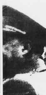
Regardless of its subject matter, the cinema presents heroes and exemplary conduct modeled on the same old pattern as the rulers. [p. 34]