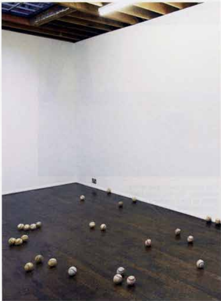
This spread, two views of the exhibition "Lutz Bacher," 2011.

Above, Baseballs , 2009, 50 used baseballs.