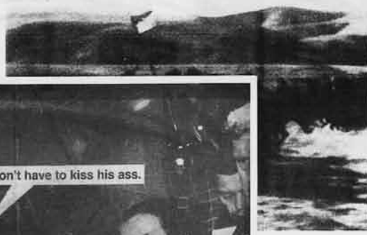
... military units, they must