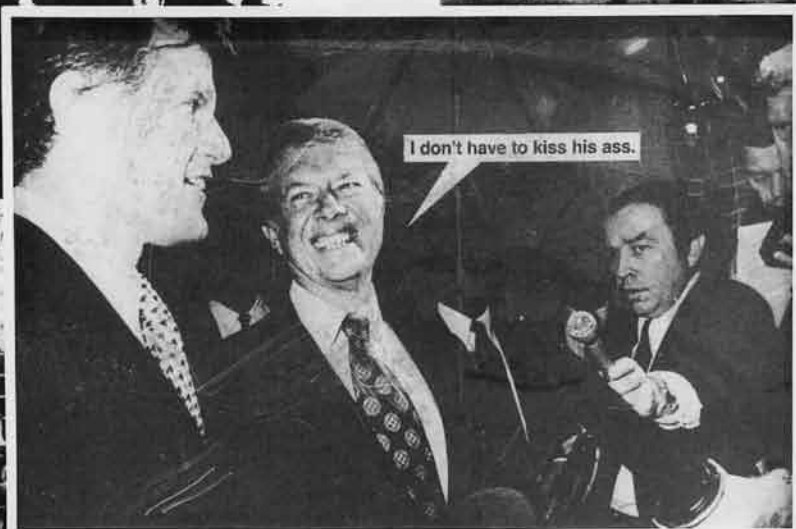
I don't have to kiss his ass.