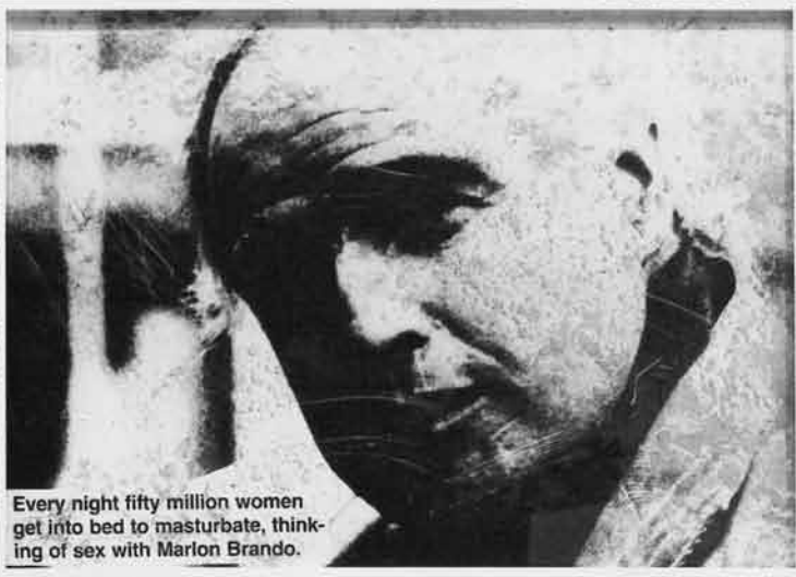
Every night fifty million women get into bed to masturbate, think- ing of sex with Marlon Brando.