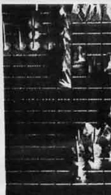
I have sometimes been reproached — wrongly, I believe — for making difficult film. Now I am actually going to make one. [p. 149]