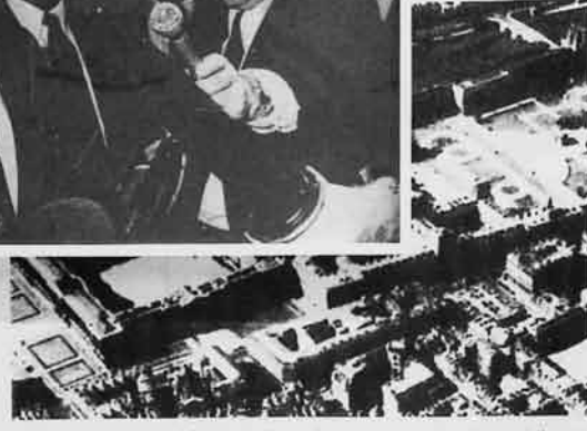
Here was the abode of the ancient king of Wu. Grass now grows peacefully on its ruins. There, the vast palace of the Yin, once so splendid and so beautiful. All this is gone forever — as the people scurrying conceals slips away. [p. 153]