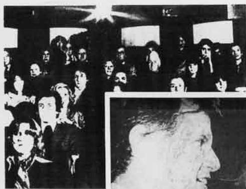
Nothing of importance has ever be- not even one like that of the age of the apostles and the first century of sons of a thousand. [p. 133]