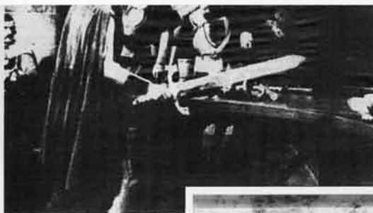
No adventure is directly created for us from part of the mass of legends drawn of the whole special class of history