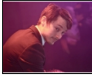
CULTURE ELIJAH WOOD'S MARFA DIARY