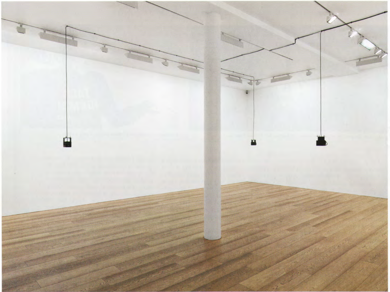
Florian Hecker: Chimerization and Hinge , both 2012, simultaneous sound installations.